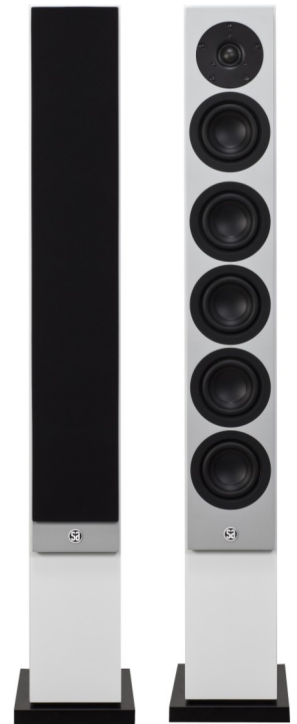
SA mantra 60 is available in six different finishes. Here is white satin

It is the contrasts in the mantra, which attract attention. The loudspeaker has got a simple design, but the first time you lift SA mantra 60, you notice its weight. Almost 22 kilograms. It tells you about the quality behind the attractive exterior. The loudspeaker is constructed of MDF with a thickness of between 18 and 48 mm. Inside, the cabinet is divided into eight chambers with angled sides, to avoid standing waves inside the speaker. Six of the eight chambers are connected to each other, while two are enclosed. One is a 3-liter sand chamber with access through the loudspeaker's base plate, while the second is the separate chamber for the midrange and tweeter. There are two different types of acoustic damping material inside the speaker. One type is glued on the sides of each of the six inner chambers, while the second type operates in the middle of the air mass in the speaker's midrange chamber. The loudspeaker's build-in electronics are designed as simple as possible, so nothing stands in the way of the audio signal.