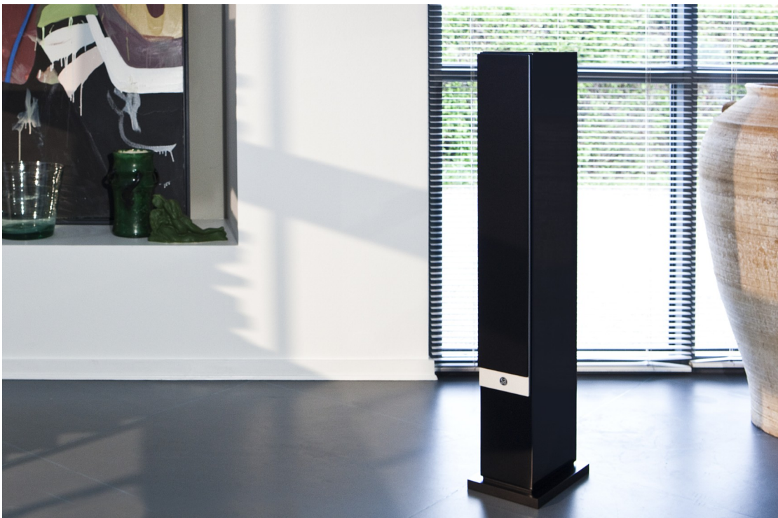
floor standing loudspeaker SA mantra 60: