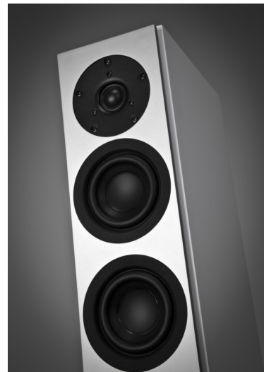
there are almost no visible screws and the front grille is attached with 16 invisible magnets.