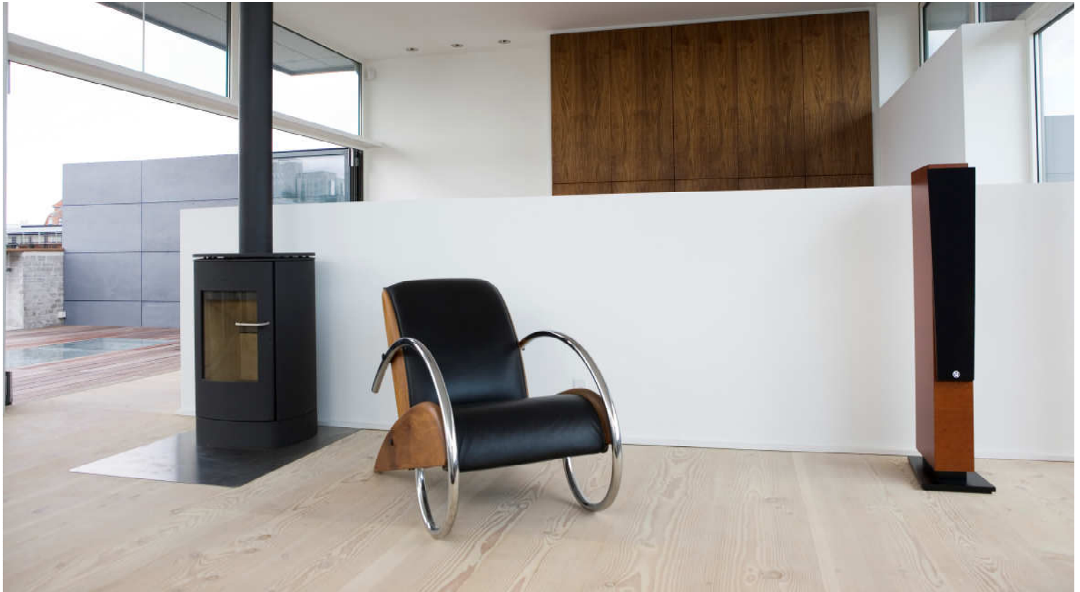
SA ranger is more than a top-class speaker. It is a beautiful piece of furniture