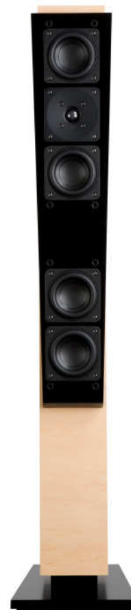
four small woofers with incredible mobility generate better sound than one big woofers

XL technology means that the woofer has an extra-long stroke system (only available in SA speakers)