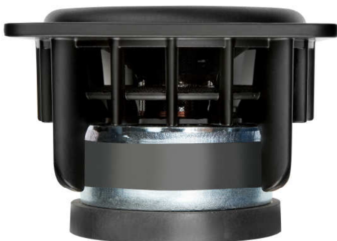
the SA W1104XL woofer: